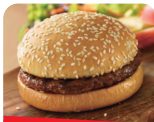
RED'S BURGER SERVES 10.....$50