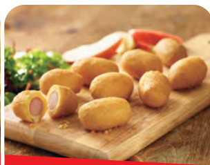
CORN DOGGIES SERVES 6-10.....$35