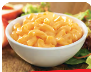
MAC IT YOURS SERVES 6-10.....$40