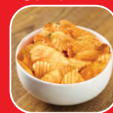
YUKON KETTLE CHIPS

ADDITIONAL SIDES For an additional $1 per person