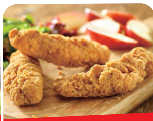
CLUCK-A-DOODLES SERVES 6-10.....$40